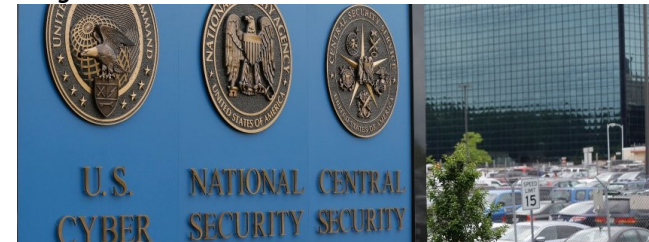
An NSA campus in Fort Meade: "All facts must be put on the table."

I ask: why would Australians want to do this? Why help the Chinese setup their wine making industries? It is the same pattern that we have seen with technology and reverse engineering.