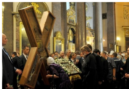
Thousands queue in Russia to see religious relic

“Around 65,000 people have queued for hours in Saint Petersburg to see a