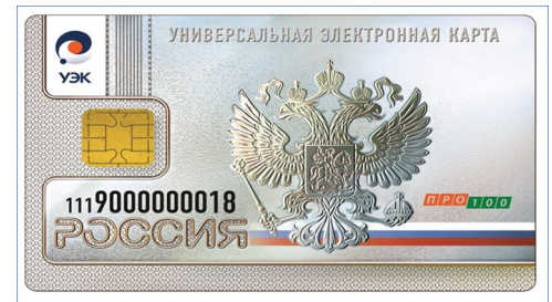
Universal electronic card (Image: Federal authorized organization "Universal electronic card")

banking application is based on the payment system 'Universal electronic card', which has a logo PRO 100.