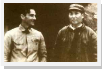
Mao with journalist Edgar Snow

were only beginning to establish their control over what later became Vietnam. Within twenty years they and the United States would meet again, under less auspicious circumstances.”