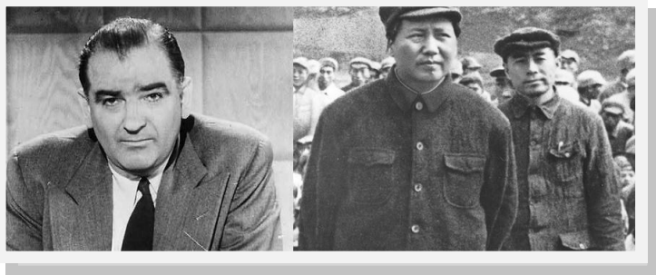
Joe (US Senator Joseph McCarthy) was right. Red China was a project of elite Anglo-American geo-political machinators.

Before reading the article "Full Spectrum Dominance in the Anglo-American Great Game" by JayAnalysis, look up on our website just some of the articles going back to the 1960s that show Western leaders have a long history of supporting Communism – and betraying their own people. www.alor.org/Volume2/Vol2No3.htm : ALOR – Dialectics : www.alor.org/Volume3/Vol3No42.htm : www.alor.org/Volume2/Vol2No5.htm : www.alor.org/Volume1/Vol1No15.htm : www.alor.org/Library/Overview.htm : www.alor.org/Volume12/Vol12No20.htm