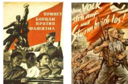
Communist and fascist posters evidence the same propaganda tactics.

It is often stated in "conspiracy circles" so-called that the Western elites help train and put Mao in power. Is this true? Can we find documented evidence for the claim? If so, it would put a lot of modern "conservative" and "libertarian" analyses in perspective. In my experience, the so-called "conspiracy" sites and alternative media outlets are far more reliable (for all their shortcomings), as anyone with any sense knows, than the mainstream media, that retarded organ of Government Inc. Those that want to live in the Matrix can stay in the Matrix.