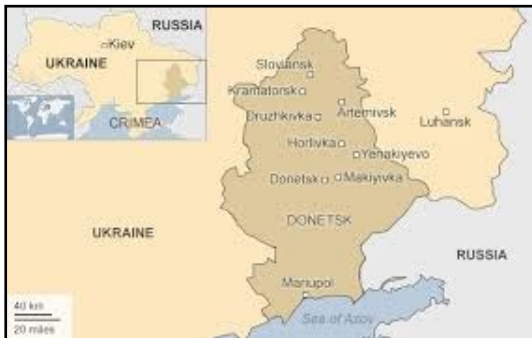
Google map of Donetsk People's Republic