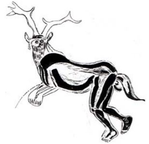
Back cover: 'The Sorcerer', c. 13,000 B.C. Rock painting and engraving. Caverne des Trois Frères, Montesquieu-Avantès, Ariège.