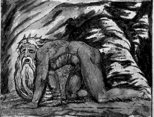
One Law for the Lion & Ox is Oppression

Note: This Angel, who is now become a Devil, is my particular friend; we often read the Bible together in its infernal or diabolical sense which the world shall have if they behave well. I have also: The Bible of Hell: which the world shall have whether they will or no.