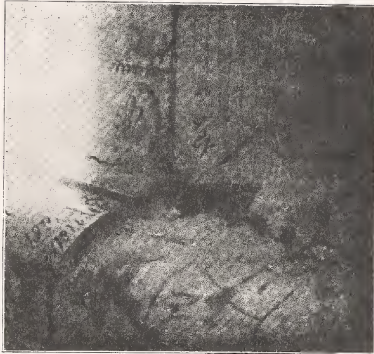
The Cabbalistic Inscription found on the wall of the Room in which Imperial Russian Family was murdered.