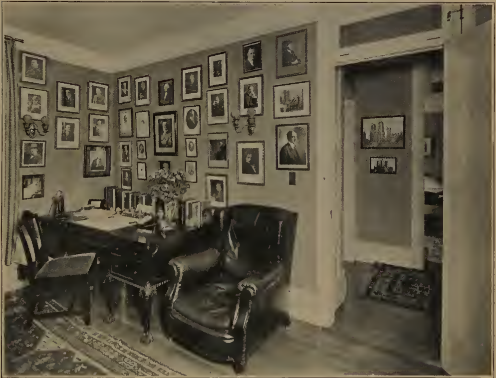
COLONEL HOUSE'S STUDY AT NO. 115 EAST 53D STREET