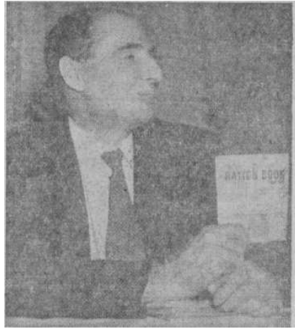
FOOD COMMISSAR STRACHEY