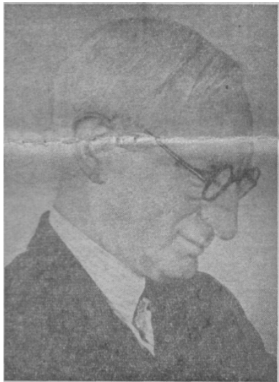
SIR WILLIAM BEVERIDGE

In God's name, Albertans, be warned in time! The Alberta "Bill of Rights" is nothing less than a special variation of the Beveridge Plan, deliberately concocted by experts in this country to deceive "the masses" in the only part of the world where social crediters are in a majority. It therefore has, of course, the necessary ingredient of monetary reform in the method by which the social security payments are