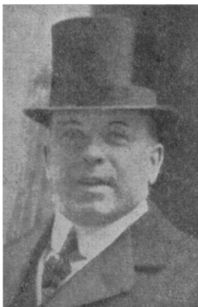
MR. MacKENZIE KING