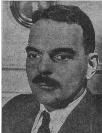
THOMAS E. DEWEY

America First leaders and key men in New York State have been advised to support Tom Dewey for re-election as Governor, and Irving Ives in his campaign for