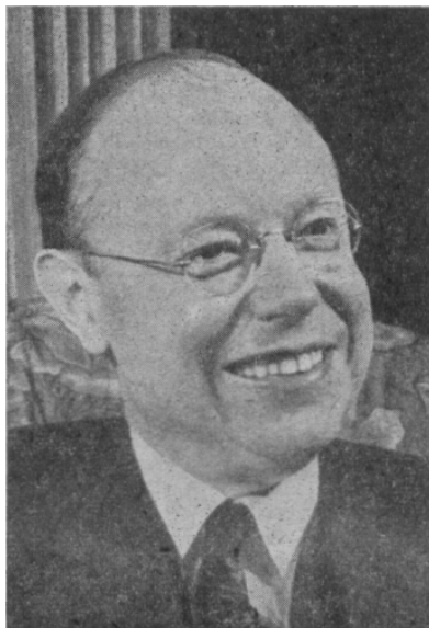
LEADING "REPUBLICAN" TAFT

Senator Robert Taft is being branded as a pro-Nazi because in a speech in Detroit he condemned the hanging of certain Germans whose alleged crimes were committed