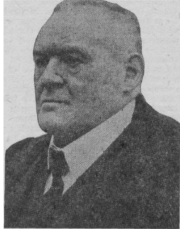
HILAIRE BELLOC He Warned of the Servile State.

duced by "State" control, the free trade union movement will be destroyed in this country just as effectively as it was destroyed in Germany. There is no free trade union movement in Russia. How can there be a free and democratic trade union movement in a country where the