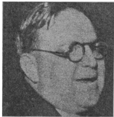
MR. LA GUARDIA