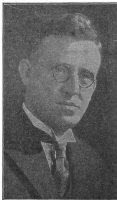
IMMIGRATION MINISTER CALWELL

SPELLING SPREE: In recent years, we have heard quite a lot about spending sprees—especially in America, about Christmas time. This time, for a change, we are told of selling sprees in U.S.A. For example, "Macy's," one of the biggest stores in the world, reduced toys by as much as 60% to quit them. Another store marked down a shipment of tricycles from £10 to £7, then to £5. Similar reports come from all States of U.S.A. Montgomery Ward, a huge mail order house, are marking down 1947 catalogues 20 to 30 per cent. Most of this is explained by the fact that the wartime money tap has been shut off. It is the same old story—prosperity in wartime, depression in (Continued on page 4)