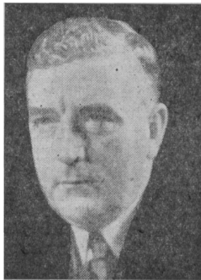
"LIBERAL" LEADER MENZIES

"Naturally, the Liberal Opposition could not be expected to adopt such a policy. It believes in the inevitability of concentration in industry even more than Labor, and its only alternative is to leave the huge corporations, which are the instru-