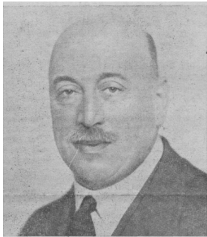
MAJOR C. H. DOUGLAS.

It is necessary not to lose sight of the undiscussed question of policy; but, before dealing with it, the sequence of events following the Mond-Turner Conference should be noted. The Conference was in 1926.