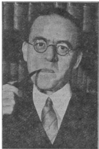
SIR STAFFORD CRIPPS

terial imported or supplied for the whole 110 per cent, and this 14 per cent, includes consumable goods, such as whisky, biscuits, tweeds and many other articles vitally needed by our own population, the wages paid for the production of the whole 110 per cent, are distributed in this country as an effective demand against the limited amount of goods for sale to the general public. That is to say, a Minister, who with his colleagues is constantly mouthing "the danger of inflation," and a Chancellor of the Exchequer who says he is conducting the finance of the country "with a song in his heart," are paying out eight times the wage costs of every production unit for which they receive any return (as Sir Stafford will not buy the imports available to "soft" currencies). With a realistic financial system, P.A.Y.E. under these conditions ought to be 17/6 in the pound, instead of