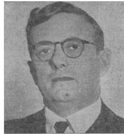
ATTORNEY-GENERAL EVATT. Conferred with Zionist agent.

"Lt.-General Sir Frederick Morgan, former chief of U.N.R.R.A.'s Displaced Persons organisation in Germany, in an interview with a correspondent of the North American Newspaper Alliance, published here (New York) today, states that the relief organisation has been, and probably still is honeycombed with Soviet secret police agents numbering hundreds and placed in the highest headquarters levels down to the lowest employees. He declared that he was able to speak freely for the first time since his retirement both as an U.N.R.R.A. official and a serving officer in the British Army. Sir Frederick stated that his severance from U.N.R.R.A. last August came as a result of his discovery of the ramifications of the Soviet network and the unwillingness of Mr. La Guardia, then Director-General of