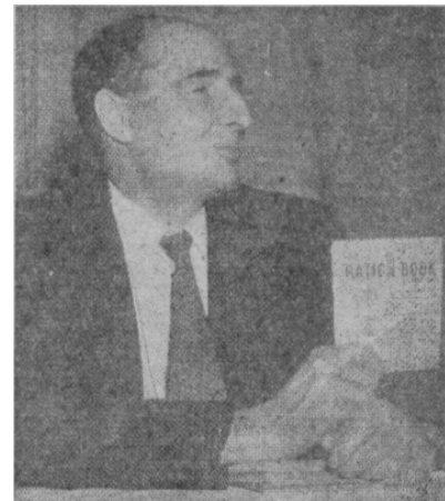
FOOD MINISTER STRACHEY. Refused Australian Food Imports!

other domestic policies is handed over to anonymous international planners, responsible Government has been destroyed. Responsible Government, which is absolutely essential if we are to have genuine democracy, can only exist when electors take sufficient interest in their own affairs to insist that their political representatives are made personally responsible for their actions. Electors can start on the food issue and ask their Members some pertinent questions relating to the matter. As a final piece of evidence showing what is planned for