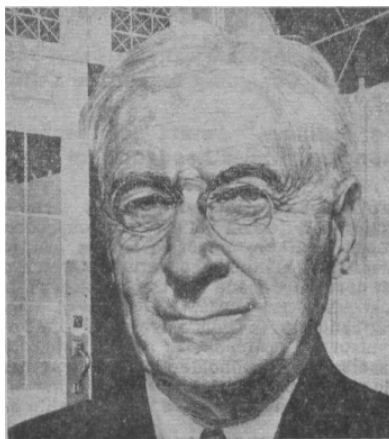
BERNARD MANNES BARUCH

6. During this year another international body was formed under the imposing title of "The United Nations Educational, Scientific and Cultural Organisation," but commonly referred to as U.N.E.S.C.O. A sub-committee of the Paris conference of the organisation has decided that U.N.E.S.C.O. is to keep an eye on the educational textbooks of all countries and will bring to the attention of the United Nations Security Council any that contain statements, which in the opinion of U.N.E.S.C.O. are undesirable. It is obvious that tremendous power to control education is thus being placed in