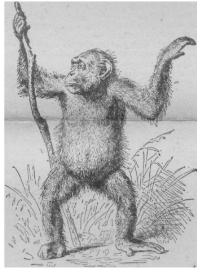
ONE OF YOUR ANCESTORS?

Take, for instance, the glorious logic of "if the rest of the body was of the same proportion, the owner of these teeth must have weighed half a ton!" Science! —why, a schoolboy would be ashamed to reason thus. I am rather surprised that your correspondent did not include in his imposing list of fossil remains the name of Hesperopithecus whose story was as follows: In 1922, Prof.