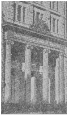
THE COMMONWEALTH BANK

The most elementary knowledge of productive or other organisation must convince any reasonable person that increased costs in industry must be passed on in increased