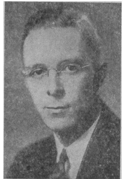
ALBERTA'S PREMIER MANNING

The political and economic systems can be made to function in the best interests of the People if they will organise for that purpose just as trade unions organise for a more limited purpose. A Union of Voters should, therefore, be organised to get the results desired in common by all People irrespective of race, religion or party affiliation.