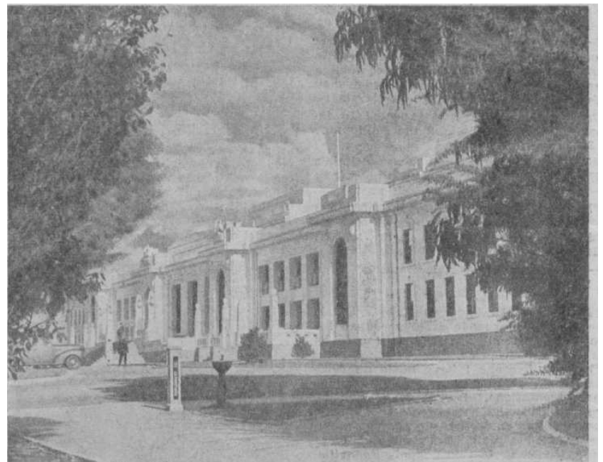
PARLIAMENT HOUSE, CANBERRA Important Centre In The Battle For The Banks

POLICY. "Australia HAD NO CHOICE but to take part in international agreements not only of a military character, but agreements ABOUT TRADE, ECONOMIC PLANNING, AND MONETARY ARRANGEMENTS. SUCH AGREEMENTS COULD BE ENTERED INTO AND CARRIED ON ONLY BETWEEN GOVERNMENTS. "TO PARTICIPATE IN SUCH ARRANGEMENTS AUSTRALIAN GOVERNMENTS OF THE FUTURE WOULD NEED TO PROVE TO OTHER POWERS THAT THEY HAD CONTROL OF THE INTERNAL ECONOMY AND MONETARY POLICY." (Melbourne "Argus," March 26, 1945.) No doubt some new readers of this journal may be surprised to find Social Crediters in the front rank of the