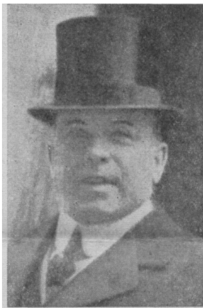
MACKENZIE-KING, CANADA'S P.M. Washington Catspaw?

"Before the outbreak of World War II., the British Government proposed to create an Empire Air Force Training School in Western Canada. Mr. Mackenzie King refused flatly; on the ground that such a proposal infringed Canadian sovereignty. A proposal is now before the Canadian Parliament to give United States troops extra-territorial rights in Canada of a far more fundamental character than those refused to the British Empire, and it is perhaps superfluous to say that the Bill has the support of Mr. Mackenzie King. It is being