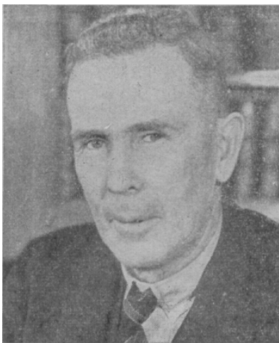
PRIME MINISTER CHIFLEY Newsprint Controller

The question that now arises is what Ezra and Frank will do when they realise