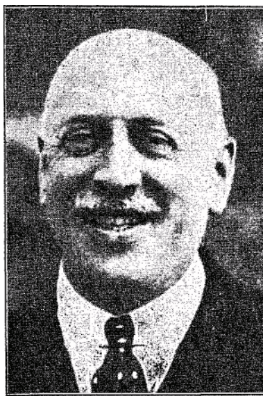
C. H. DOUGLAS