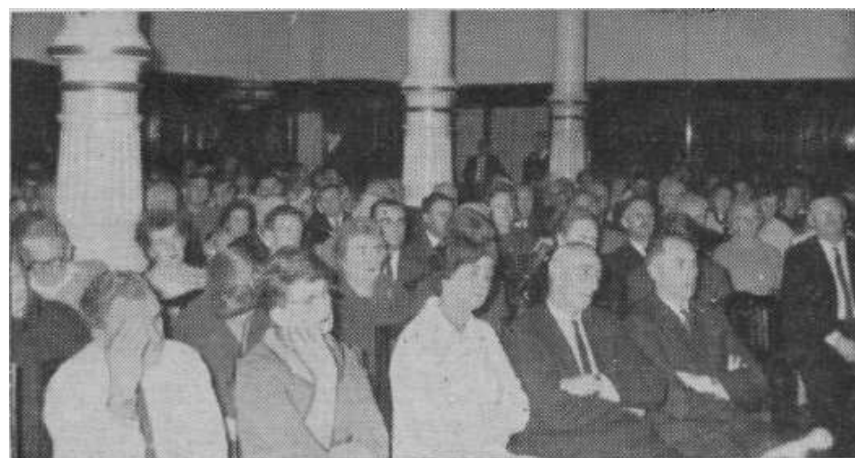
A section of the record audience at the Annual League of Rights Seminar.

That gives to one a very false and misguided sense of security by placing too much reliance, and faith, on what is told us through the mass media of information, heavily infiltrated by Fabian Socialists who, through their