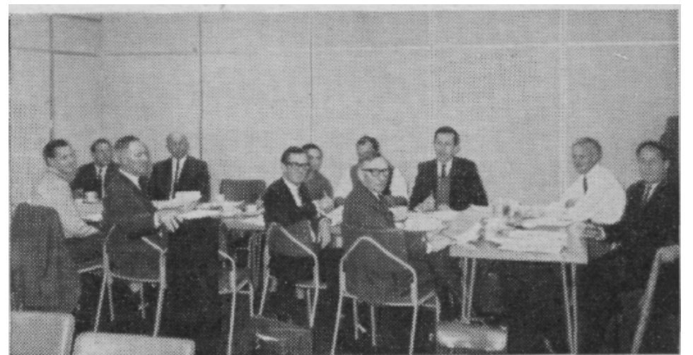
National Secretariat of The League of Rights Meets on Friday, September 6.