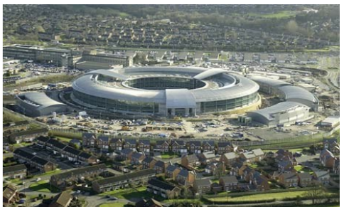
GCHQ, the UK's eavesdropping and security agency and the NSA's counterpart

"UK law requires that any directed surveillance is focused on a specific individual or premises. There is a clear concern that the collection of the relevant information was not collected as part of a directed operation, and if that has happened the legality of obtaining the information is far from clear.