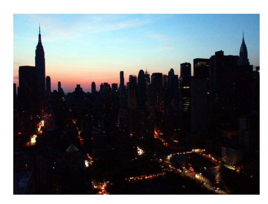
Read further here...

attacks and cyberattacks that could take down large sections of the power grid...."