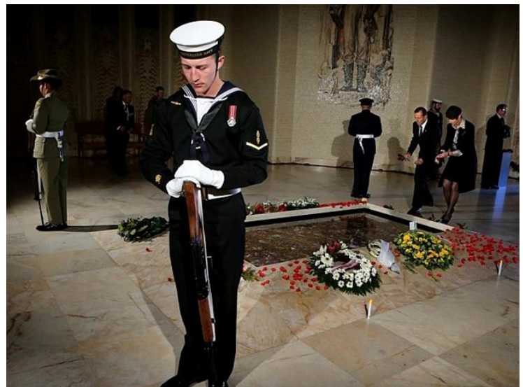
"known unto God" Australian War Memorial, Canberra