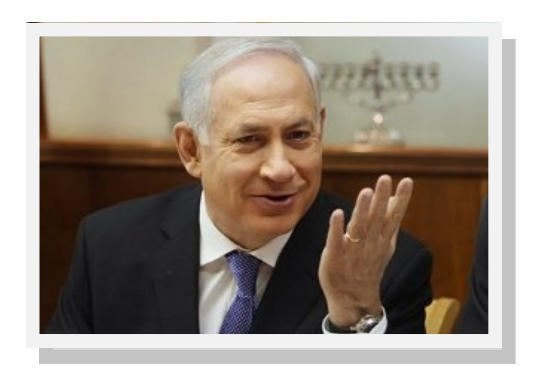
Israeli Prime Minister Benjamin Netanyahu

"Citing Holocaust, Israel Demands 'Strict Regulation' of Antiwar Protests in Europe" -