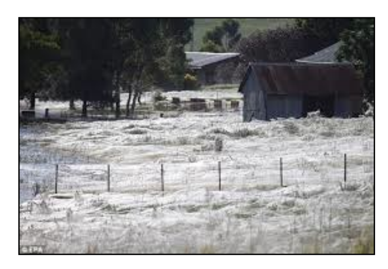
Daily Mail UK photo captured the webs covering the fields

In 2012 parts of Australia experienced severe flooding and many folk had to evacuate their homes for dryer ground. The UK Daily Mail reported on the floods and another natural phenomena obviously resulting from the floods - millions of spiders had spun their webs across fields, just as Mr. Fukuoka had seen happen on his farm in Japan.