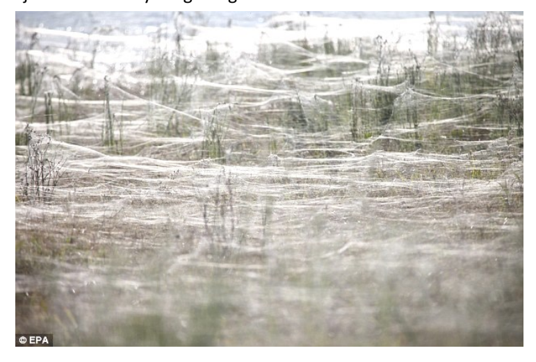
(Continued on page 6)

As flood waters raced past the town of Wagga Wagga, in New South Wales, the spiders were forced to clamber up trees and bushes, spinning their webs as they climbed. The result was this amazing panorama - glistening sheets of web covering just about everything in sight."