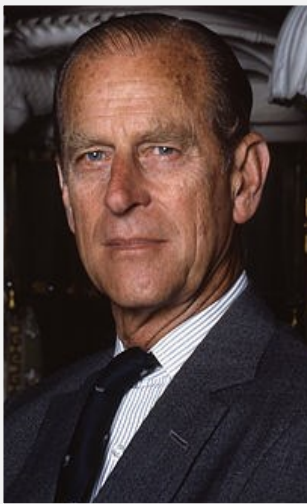
The Duke of Edinburgh, 1992

Duke Is Deserving of Knighthood: There seems to be a lack of awareness in regard to the appointment of the Duke of Edinburgh as a Knight of the Order of Australia.