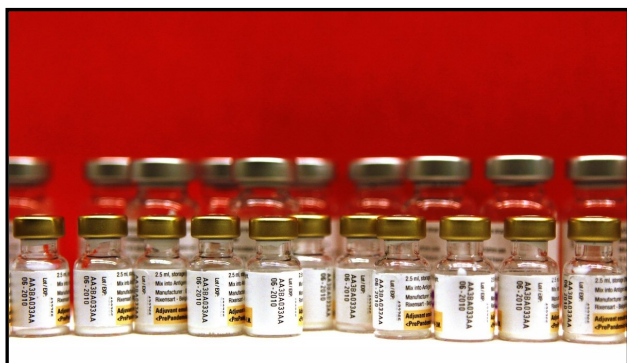
Bottles of Pandemrix, used as a vaccination against swine flu, now banned for those under 20

Brain-Damaged UK Victims of Swine Flu Vaccine to Get £60 Million Compensation by Tom Porter, March 2, 2014