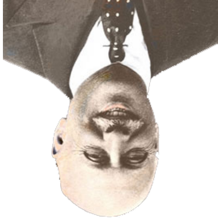
Major Clifford Hugh Douglas,

M.I.Mech.E., M.I.E.E., consulting engineer, economist, author, and founder of the Douglas Social Credit Movement, was born in 1879 and died in 1952. Among other posts which he held in his earlier years were those of engineer with the —