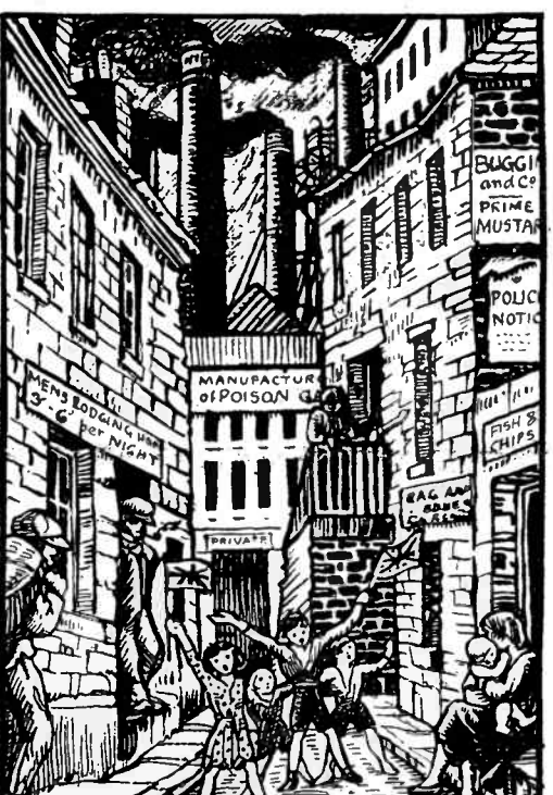
"Rule Britannia! Britannia rules the waves, BRITONS-never-never shall be slaves."

Dilemma after dilemma, and the solution — 'War or National Dividends-Work for All or Leisure for