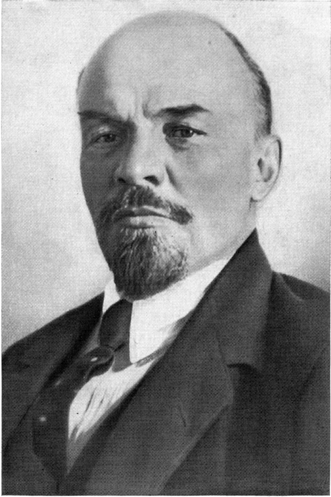
V. I. LENIN 1918