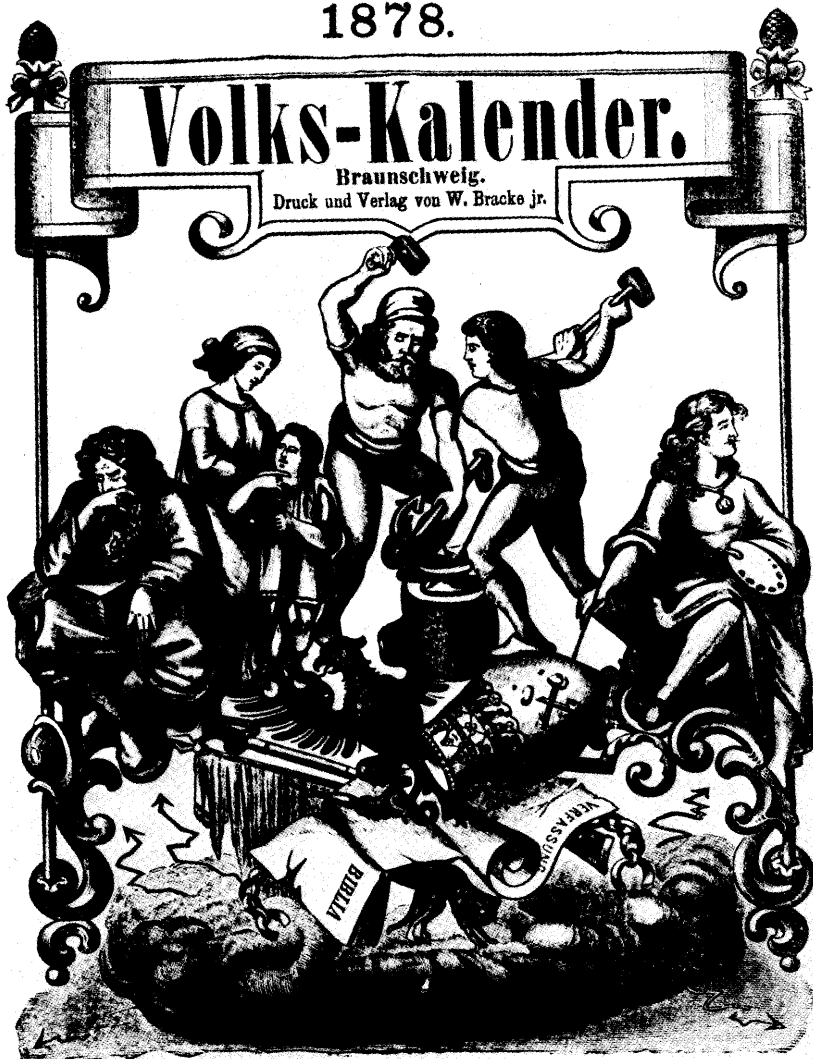
The title-page of Volks-Kalender , Brunswick, 1878