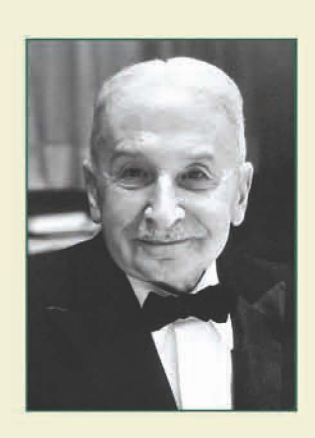
Ludwig von Mises